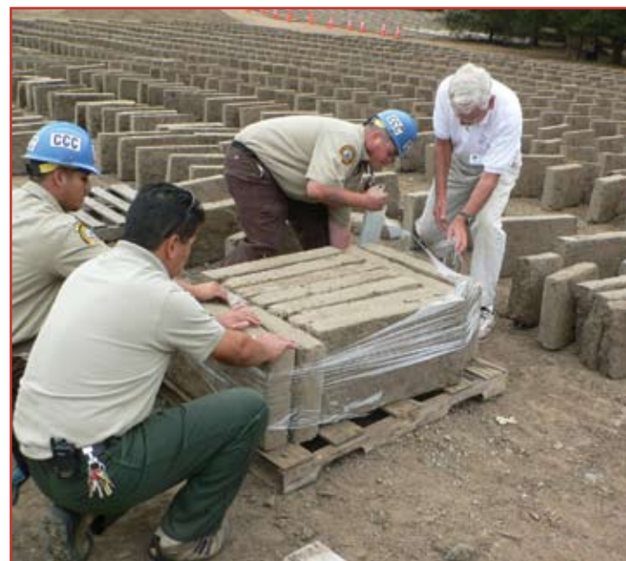
◀ The CCC worked with State Parks staff to place bricks on pallets and shrink wrap them for transport.