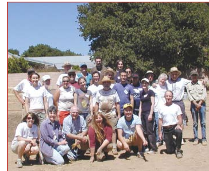
▲ July 28th volunteer group.

The following two Saturdays, August 4 and 11, were also volunteer days. The work moved along smoothly and we were able to make approximately 500 bricks total on both days. Once the bricks were stable, they were stood on their side to cure completely. The bricks