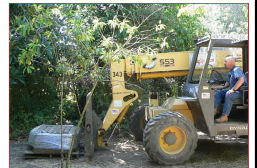
► Kirk Lingenfelter, State Parks Pajaro Sector Superintendent, uses the forklift to transport the palletized bricks to the storage area.