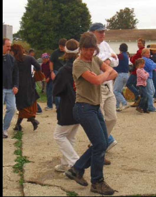
▲ Come dance at the Harvest Festival, Wilder Ranch State Park in October.