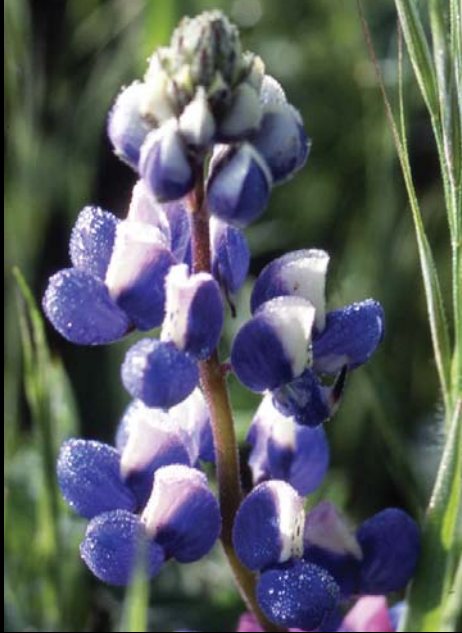
Sky Lupin

Friends of Santa Cruz State Parks 144 School Street Santa Cruz CA 95060