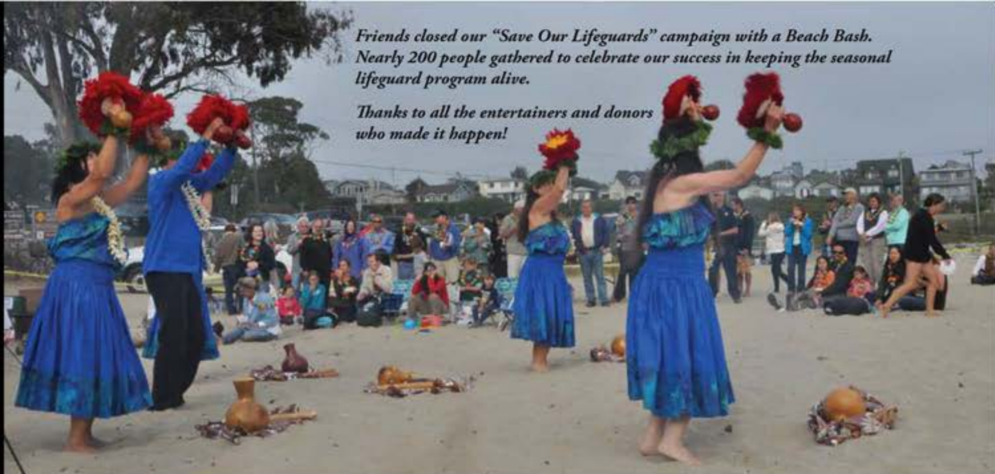
Dancers from the Hula Halau 'O Mahina I Ke Kai provided fabulous entertainment at the Beach Bash.

Thanks to all the entertainers and donors who made it happen!